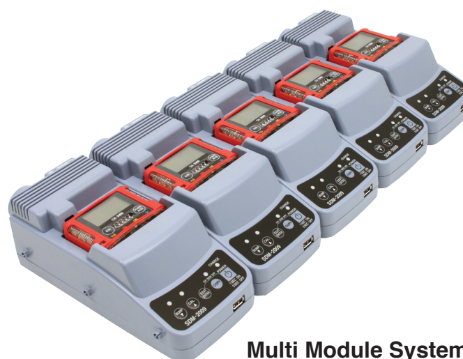
Multi Module System