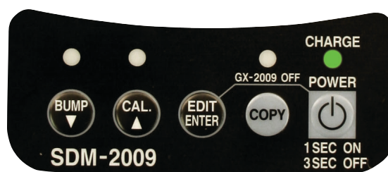
Control Panel View