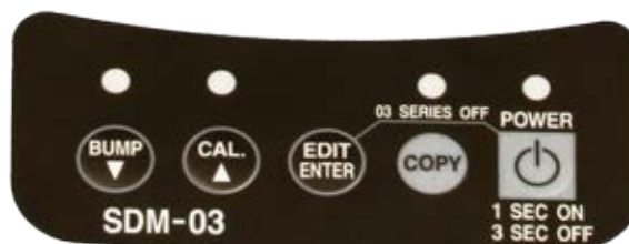
Control Panel View