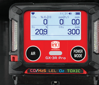
Confined Space with Connected Worker