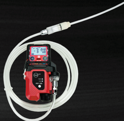
With Hose and Probe RP-3R