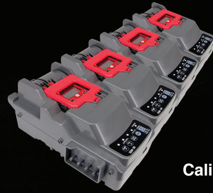
Calibration Stations SDM-3R