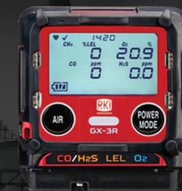
Smallest & Lightest 4 Gas Monitor