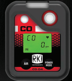
Single Gas Clip on