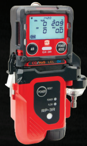
Attachable Sample Draw RP-3R