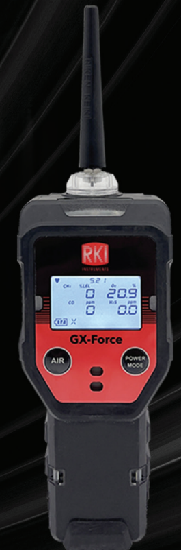
Confined Space with Internal Pump