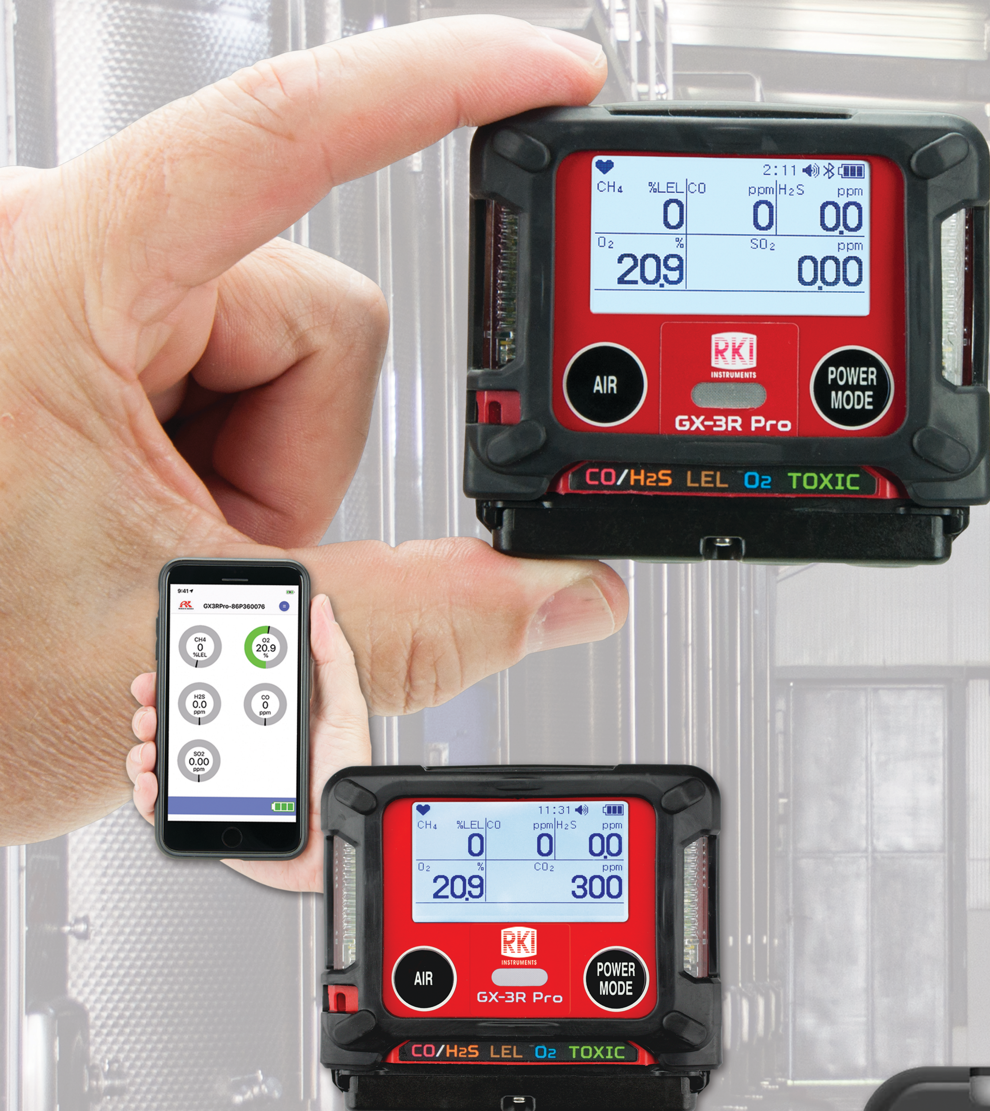
5 Gas Monitor with CO2 GX-3R Pro

OSHA compliant confined space entry gas monitoring