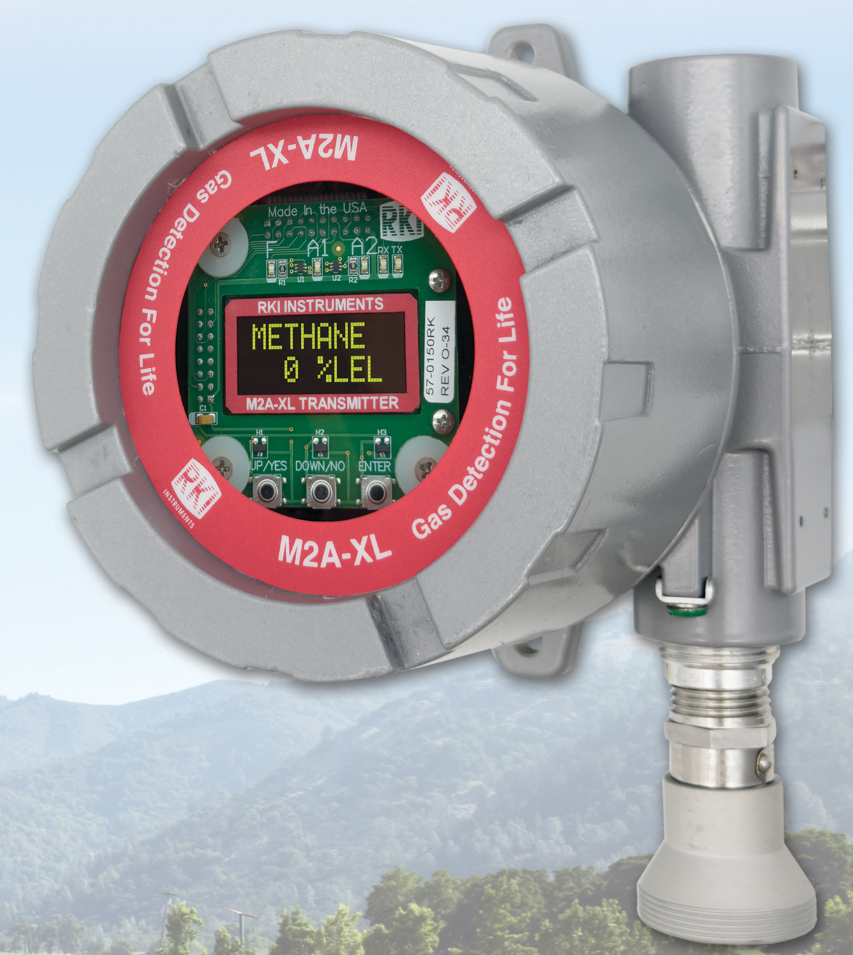
Continuous Stand Alone Monitoring M2A XL