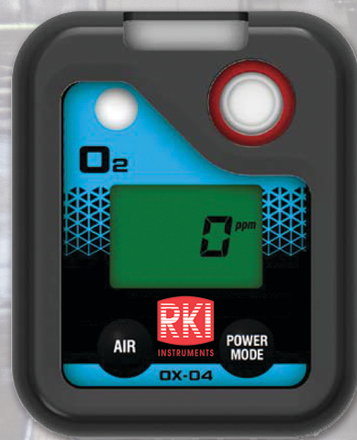
Oxygen Deficiency Monitoring 04 Series