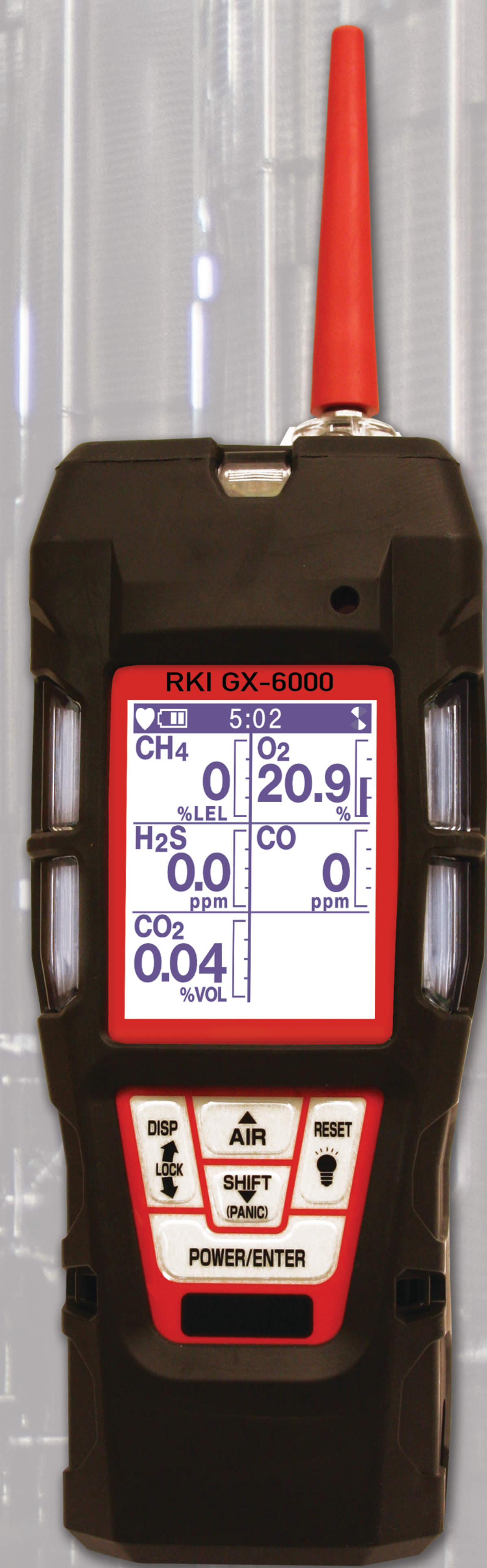
6 Gas Sample Draw with Smart Sensors Including CO2 GX-6000