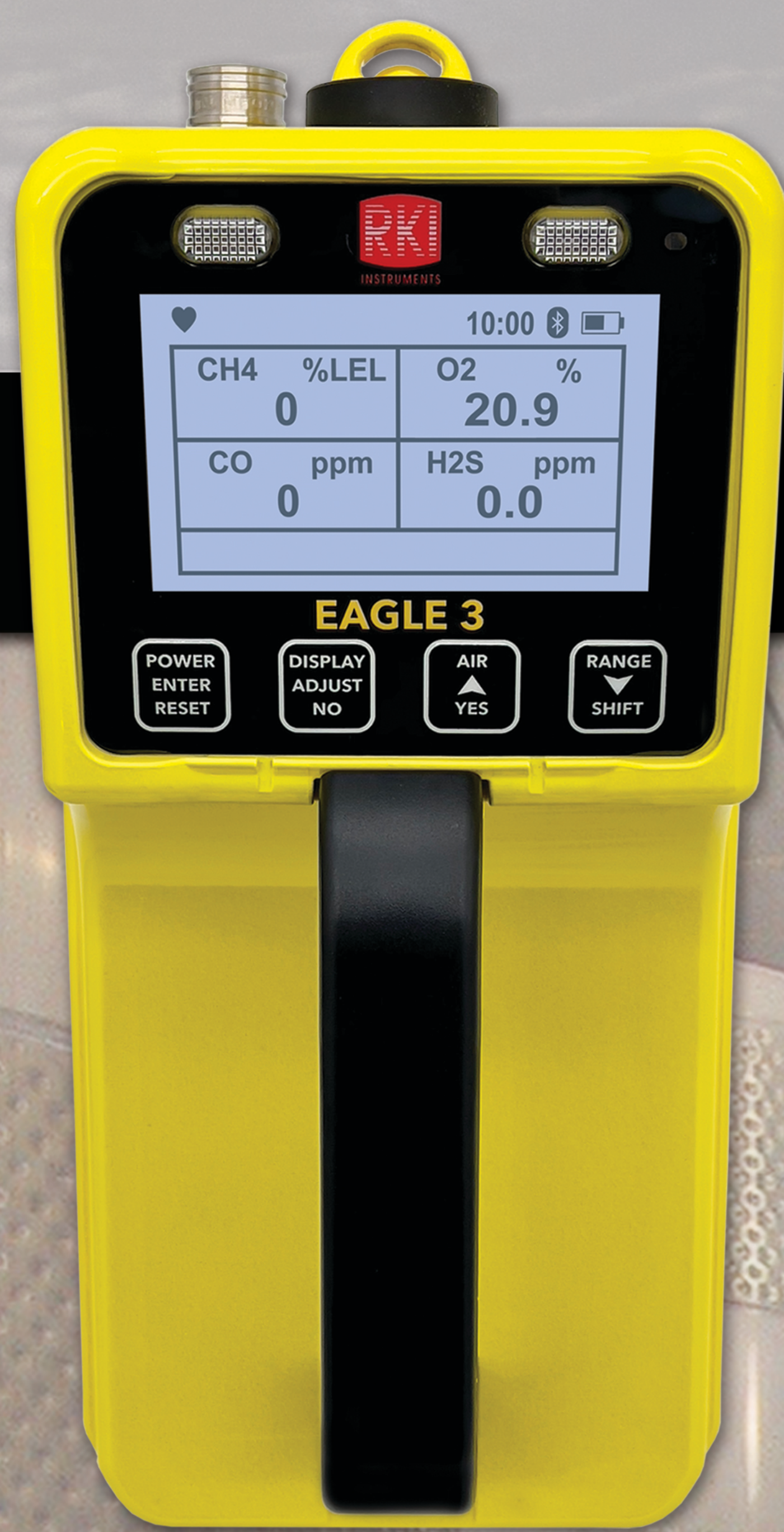
6 Gas with Long Range Sample Draw EAGLE 3